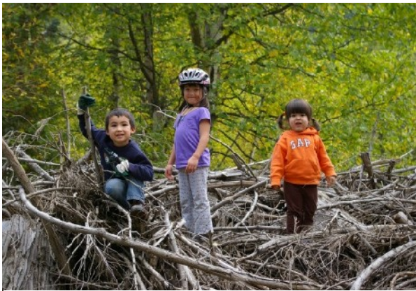
Glen's Uncle Earl's property at Shuswap Lake.