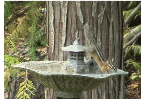
Portly the chipmunk was our new and regular visitor to the feeder during the summer of 2003

Thank you for spending your time reading our update. We hope you have a super holiday season and best wishes to you and your family for 2004! *